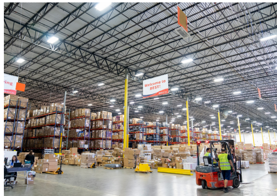
One of the Best Inc.'s warehouses in the U.S.