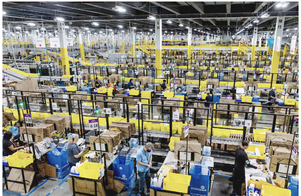
Amazon warehouse