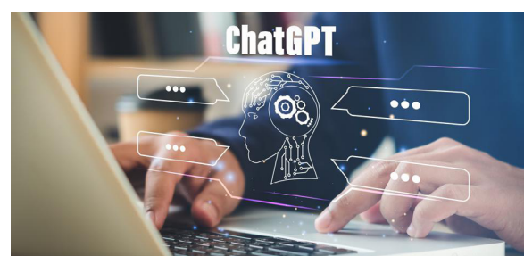
ChatGPT concept art