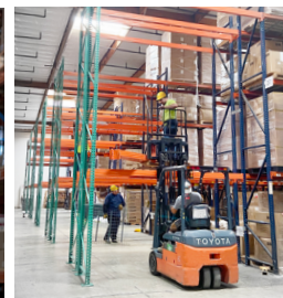
Photo: Best Inc. installing new racks

Together, we can create a thriving community of businesses that rely on our exceptional warehousing services.