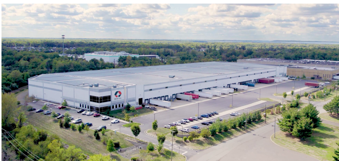
New Jersey Warehouse

By expanding our warehouse capacity, we can offer several key benefits to our clients: