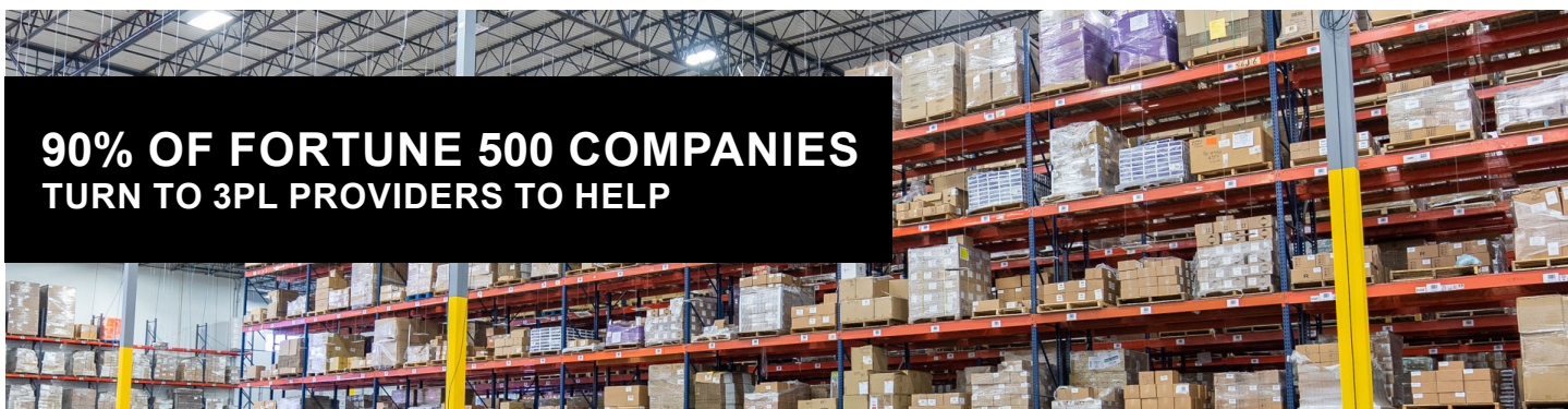
Best Inc. New Jersey warehouse

If you're in the process of scaling your ecommerce business, you probably already know this to be true, particularly when it comes to logistics, shipping, and fulfillment. It's difficult to focus on marketing, product development and relationship building when you're devoting all your time to negotiating shipping contracts or putting out fires. As the ecommerce market has grown exponentially, so too has the 3PL market, which is forecast to reach $1.75 trillion by 2026.